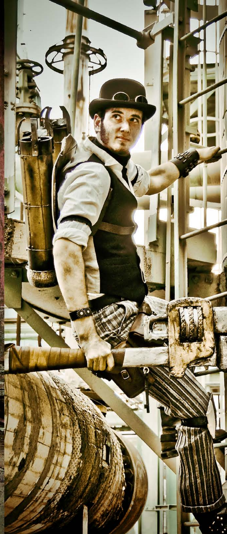
VAMPIRE DEFENSE EQUIPMENT SHORT RANGE JUMP PACK